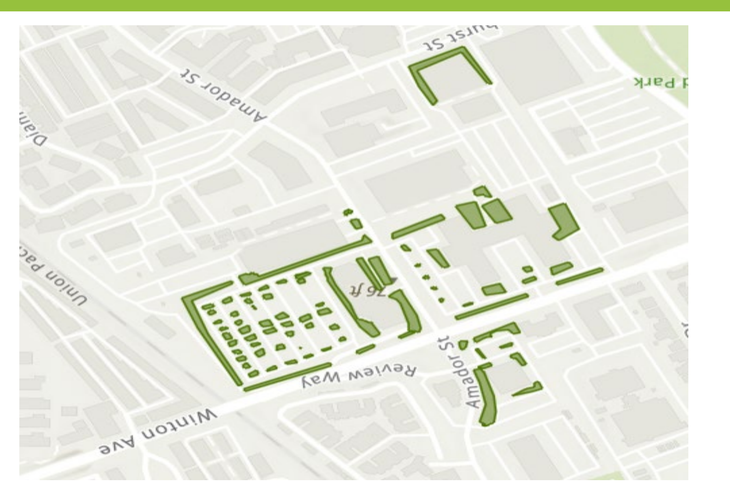
The green on this map is made up of small polygons which isolate potential area to apply compost or mulch