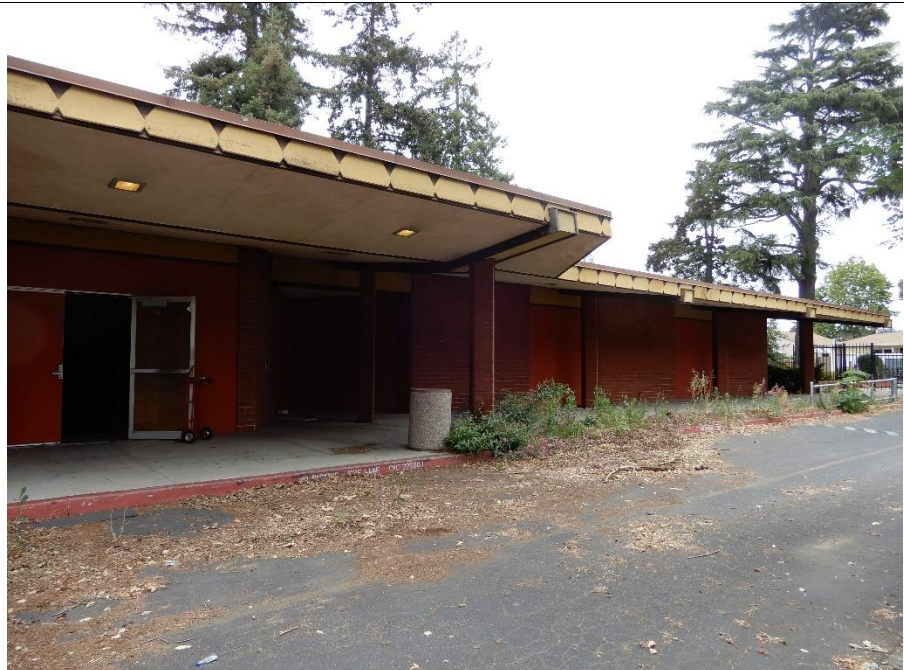
South façade, east side, view northeast (ARG, July 2021)