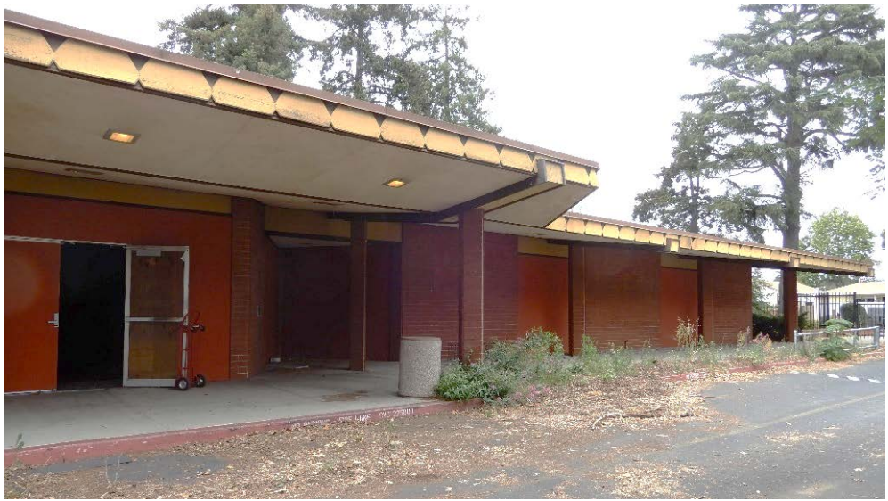
Figure 3. South façade, east portion, view northeast (ARG, July 2021)