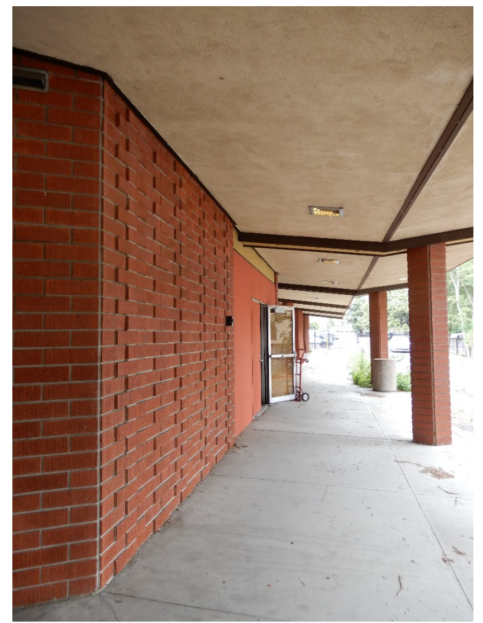
Figure 4. South façade, view east showing façade, column, and eave detail (ARG, July 2021)