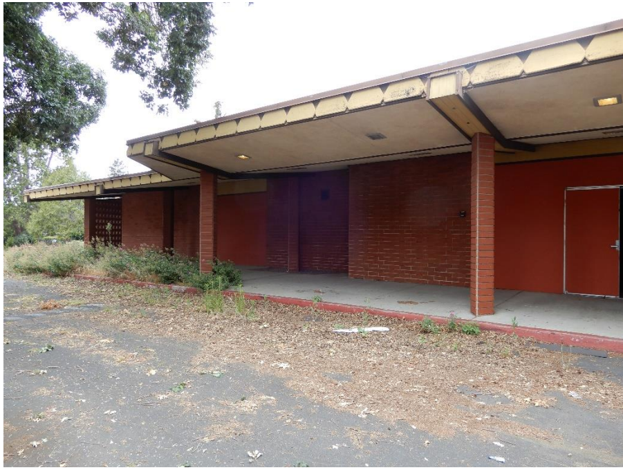
South façade, west side, view northwest (ARG, July 2021)