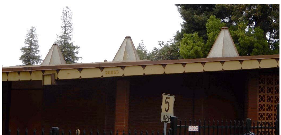
Figure 8. Skylights, view northwest (ARG, July 2021)

Four peaked hexagonal skylights are located at the ridgeline of the roof: three are located east of the center of the building and one is located at far west (Figure 8). The skylights are frosted glass with metal seams and caps.