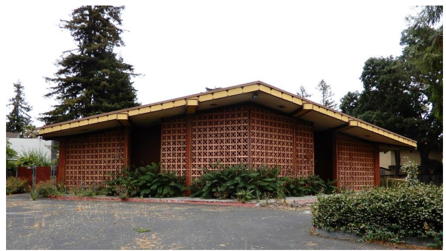
West façade, view east (ARG, July 2021)