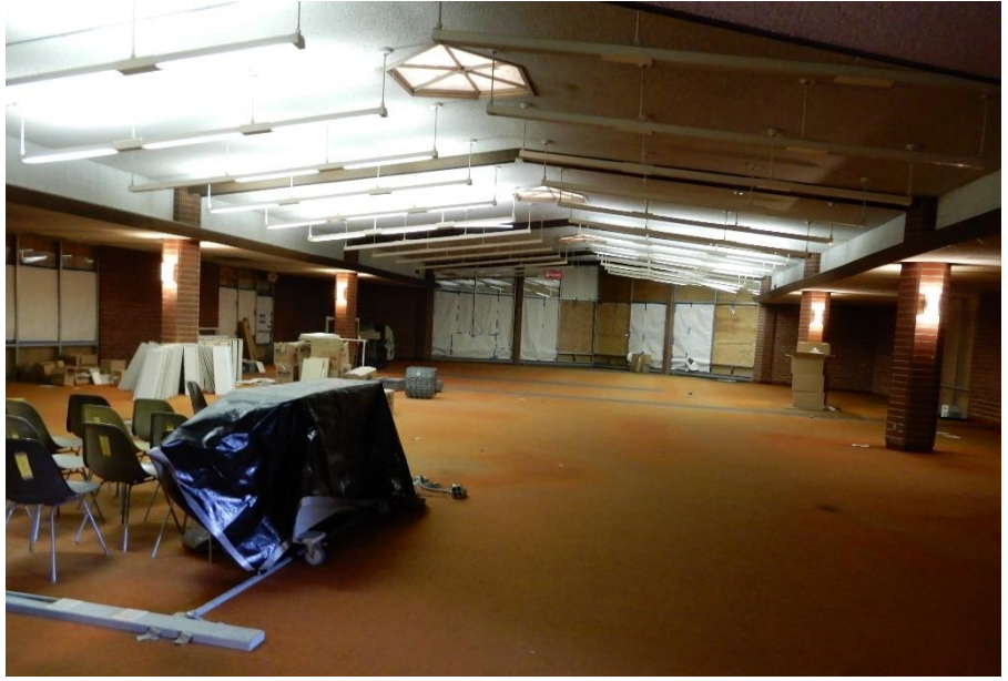
Open plan area at east side, view east (ARG, July 2021)