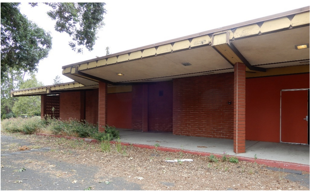
Figure 2. South façade, west portion, view northwest (ARG, July 2021)

The primary (south) façade faces onto a paved pedestrian walkway (Figures 2, 3). The primary entrance is located west of center at a shallow projecting volume, and includes fully glazed aluminum leaf doors surrounded by large sidelites and a broad transom. East of the entrance, an angled recessed area includes an integrated book drop with aluminum hardware. West of the entrance, the brick façade is ornamented by a raised brick pattern (Figure 4). The remainder of the façade consists of alternating bays of brick and large six-lite glazing surmounted by painted wood transom panels. The façade is spanned by the extended eaves of the roof, which project out further and angle up above the primary entrance and its flanking bays. The eaves are supported by two rows of brick columns – one close to the façade and one closer to the terminus of the eaves – with a diamond-shaped profile. The undersides of the eaves are finished in stucco and include recessed lighting with aluminum hardware. The eaves terminate with a thick fascia ornamented with cut plywood in a notched geometric pattern. This fascia configuration continues at all façades.