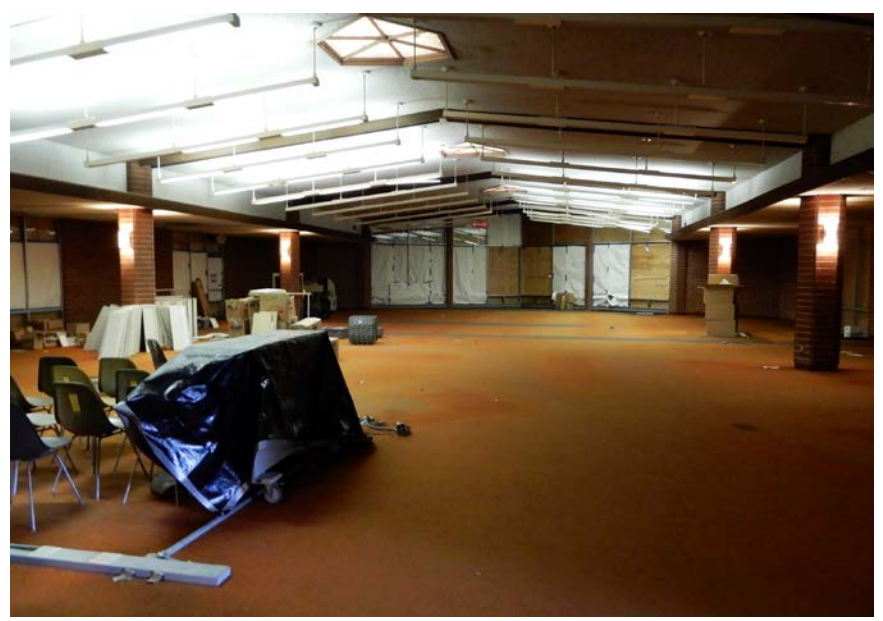
Figure 9. Large undivided space at the east portion of the interior, view east (ARG, July 2021)

The interior of the building includes a large, undivided space at the east portion of the building; an entry vestibule and divided rooms at the center of the building, including offices and rest rooms; and a smaller undivided space at the west portion of the building (Figure 9, 10). The ceiling has a higher, gabled profile at the center of the open spaces, with lower ceilings in the middle of the building and around the perimeter; lower portions are supported by brick columns with a hexagonal footprint. Finishes include a concrete floor covered with carpet; ceramic tile floors in the restrooms; wallboard, hard plaster, and brick walls; and sprayed acoustical plaster at the ceiling. Light from the exterior skylights is filtered through hexagonal lenses; additional lighting is both recessed and bar pendant.