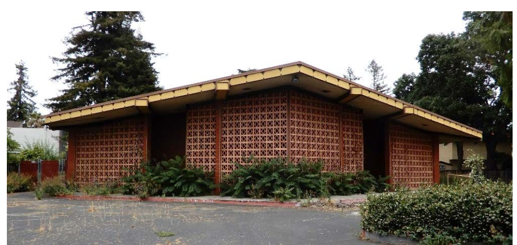
Figure 6. West façade, view east (ARG, July 2021)

The west façade faces onto a paved pedestrian walkway and also has a convex angled profile (Figure 6). Two glazed bays at center are flanked at north and south by one brick and one glazed bay. The northernmost glazed bay includes one fully glazed aluminum entry door. Bays are articulated by engaged brick columns with a diamond-shaped footprint. Extended eaves include projecting box purlins finished in painted wood and supported by brick columns with a diamond-shaped footprint. Most of the façade is spanned by concrete breeze blocks with two openings for pedestrian access. The eaves terminate with the typical fascia configuration.