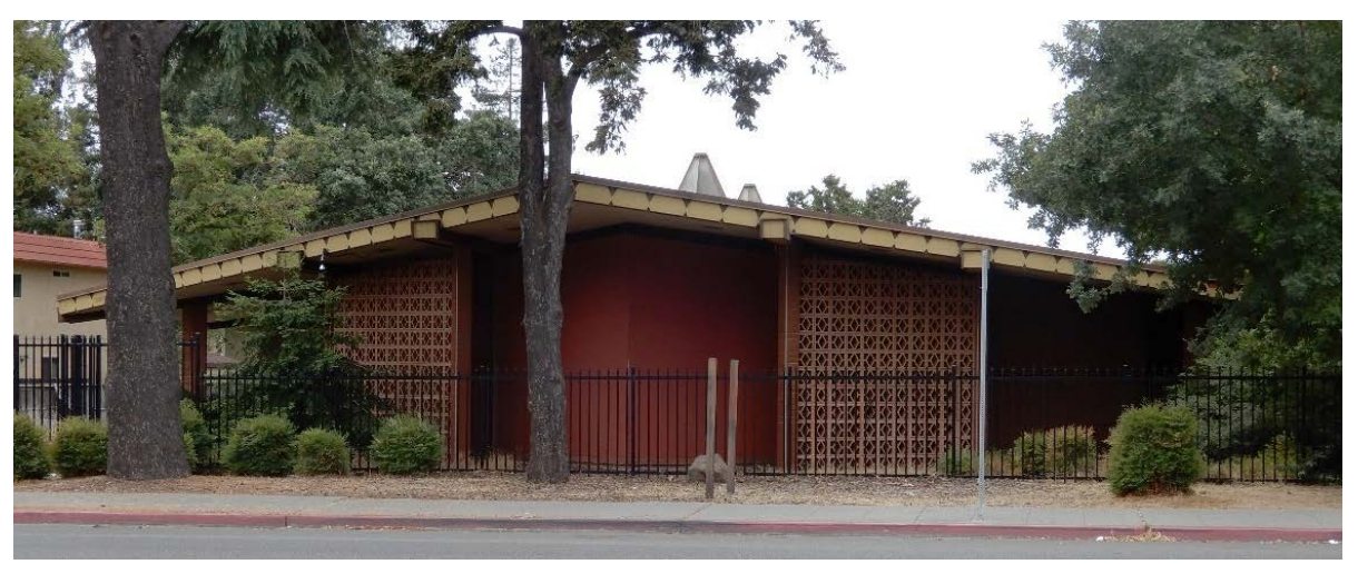
Figure 1. 20055 Redwood Road, Castro Valley, east façade, view west

At the request of Strategic Economics, Inc., Architectural Resources Group (ARG) has prepared this Historic Resource Evaluation (HRE) for the property at 20055 Redwood Road (subject property) in Castro Valley. The subject property is the former Castro Valley Public Library, a one-story Mid-Century Modern style building designed by the architecture firm Wahamaki & Corey and constructed in 1962. This HRE includes a description of the subject property, a development chronology and relevant historic contexts, and an evaluation of the subject property's potential eligibility for listing in the National Register of Historic Places (National Register), the California Register of Historical Resources (California Register), and the Alameda County Register of Historic Resources (Alameda County Register).