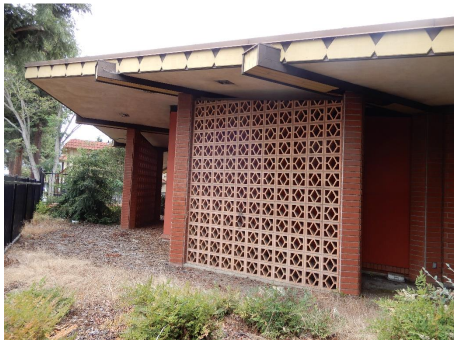
East façade, north side, detail of breeze block, view southwest (ARG, July 2021)