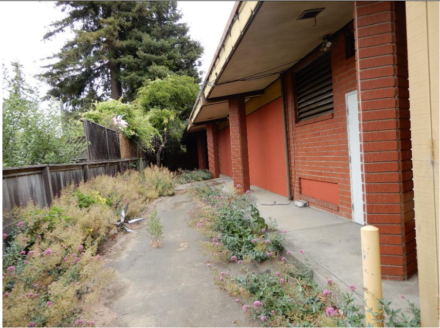
North façade, view east (ARG, July 2021)