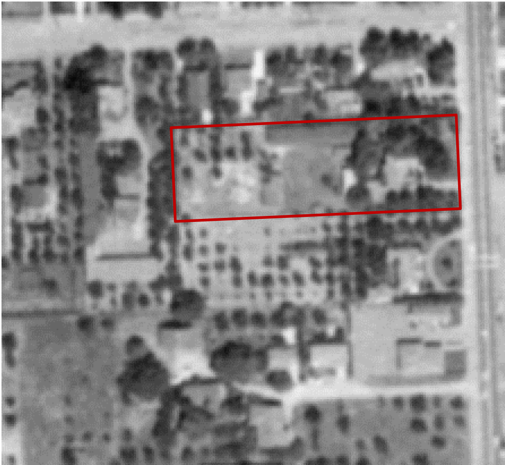
Figure 12. 1958 aerial photograph, site of the subject property lot outlined in red (UCSB FrameFinder, 1958_6V-106)

In June 1958 the Board of Supervisors ordered an appraisal of the site and began to consider strategies for funding the project. The Castro Valley Library Advisory Committee recommended that the project be funded by direct appropriation or by loan from the Alameda County general fund. The Board of Supervisors also considered funding from county-wide sales tax revenues, or the establishment of a library services area, within which special taxes would be levied.<sup>5</sup> In August 1958, the Board of Supervisors approved the selected site, allocated $32,000 for its purchase, and set up a county service area to finance the library buildings program.<sup>6</sup> The sale was completed in September 1958.<sup>7</sup>