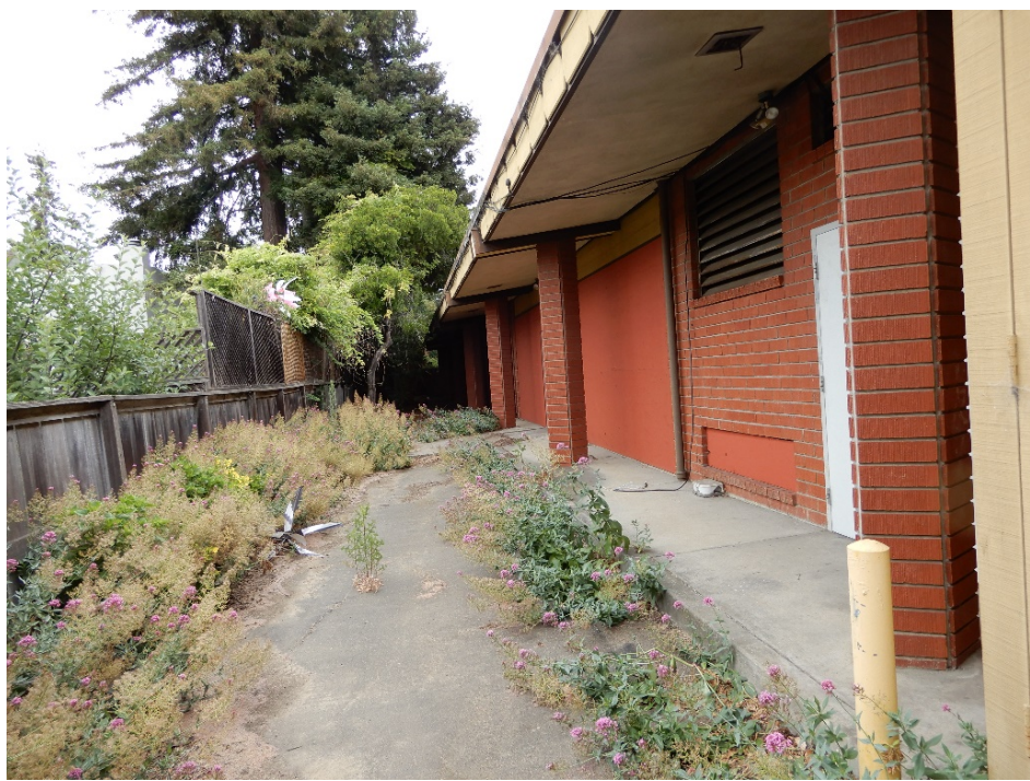
Figure 7. North façade, view east (ARG, July 2021)

The north façade faces onto a paved pedestrian path and includes alternating brick and glazed bays (Figure 7). An angled recess is aligned with the similar angled recess at the primary (south) façade. Utilitarian features include metal egress doors, a large rectangular vented opening, and free-standing HVAC equipment with a wood enclosure, located close to the west side of the façade. The eave overhang is shallower than at other façades and supported by one row of brick columns with a diamond-shaped footprint. The eaves terminate with the typical fascia configuration.