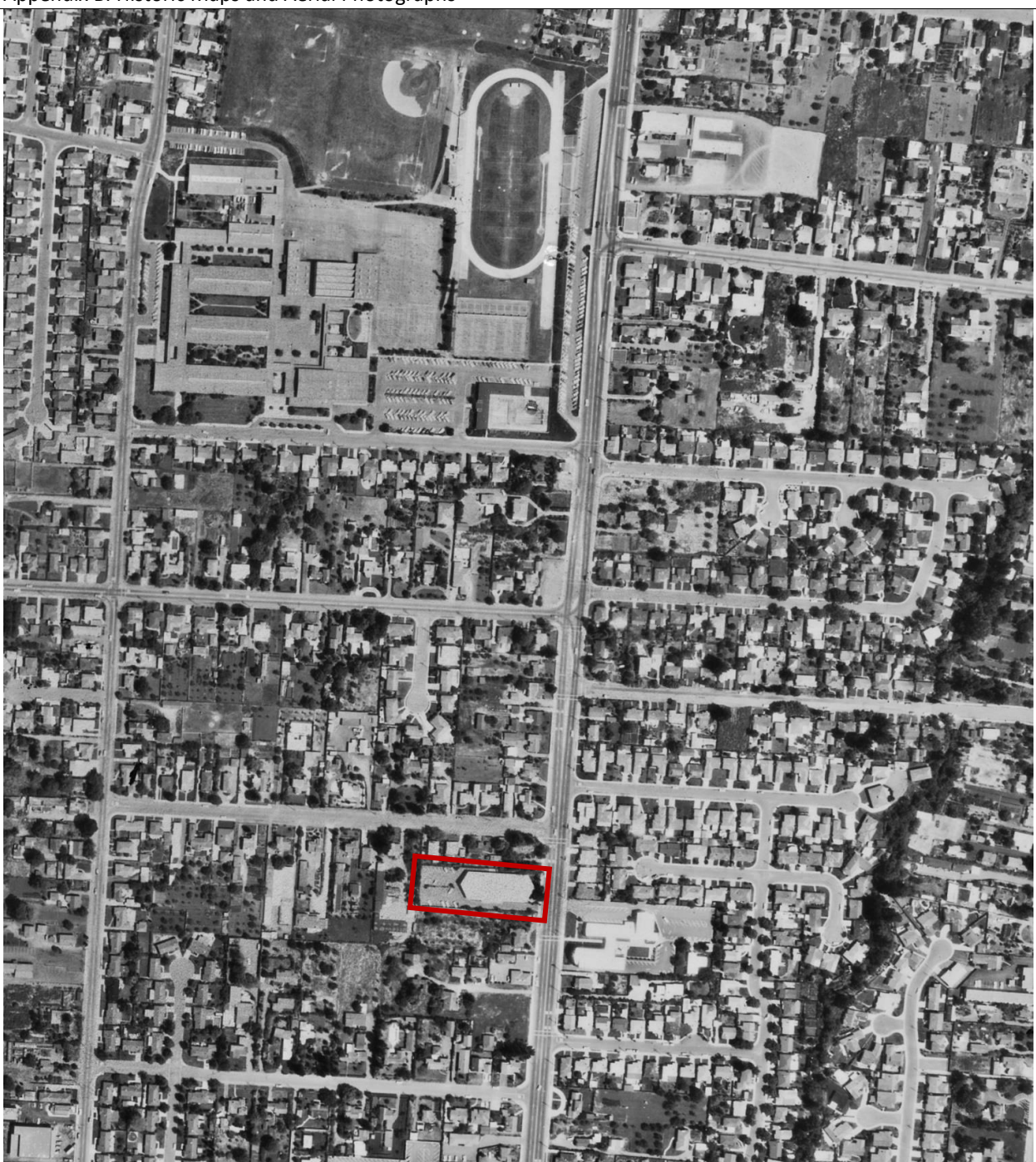
1965 aerial photograph, site of the subject property lot outlined in red (UCSB FrameFinder, cas-65-130_5-39)