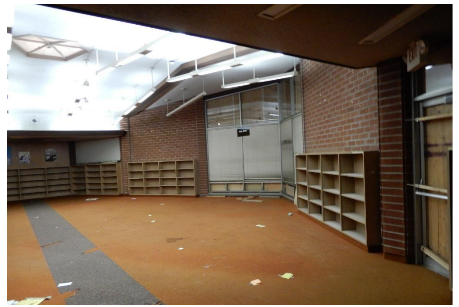
Open plan area at west side, view southwest (ARG, July 2021)