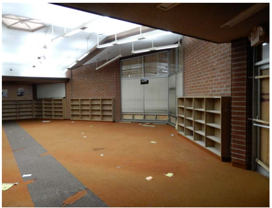
Figure 10. Smaller undivided space at the west portion of the interior, view southwest (ARG, July 2021)