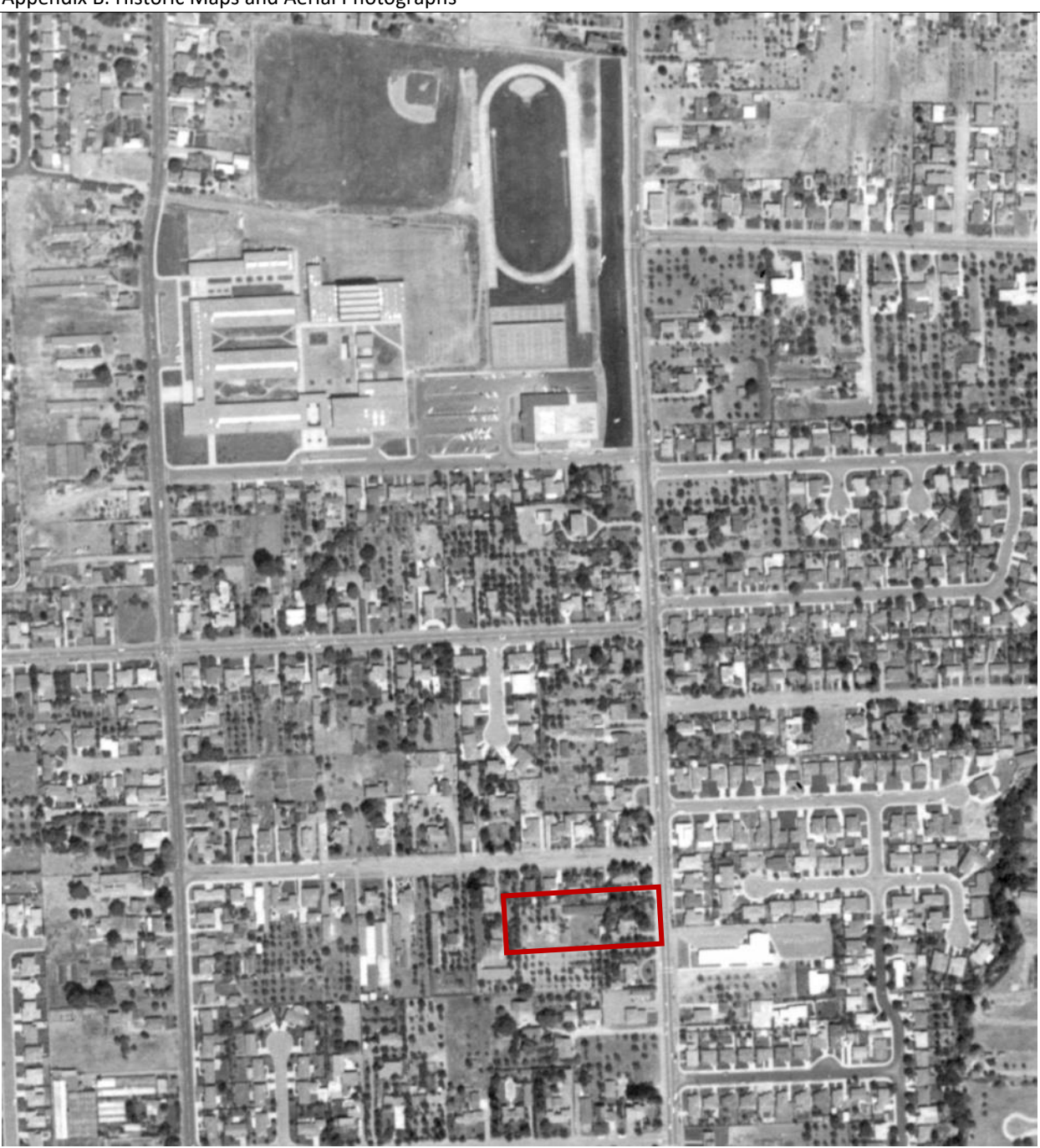
1958 aerial photograph, future site of 20055 Redwood Road outlined in red