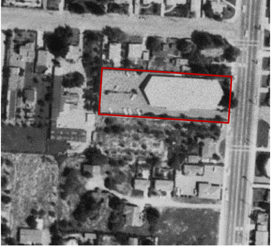
Figure 13. 1965 aerial photograph, site of the subject property lot outlined in red

By the close of the 1980s the library no longer adequately served the community: the book collection had risen to over 100,000, close to double what the library was designed for, and the building was not equipped to provide newly important services such as computer stations.<sup>22</sup> In July of 1990, the Alameda County Board of Supervisors initiated a planning process for eventual construction of a new library. The Castro Valley Library at 20055 Redwood Road closed to the public on September 13, 2009.<sup>23</sup> On October 31, 2009, on opening day of the new Castro Valley Library, 2,000 people participated in a human chain in which books were passed from the old library to the new, located more than half a mile away at 3600 Norbridge Avenue.<sup>24</sup>