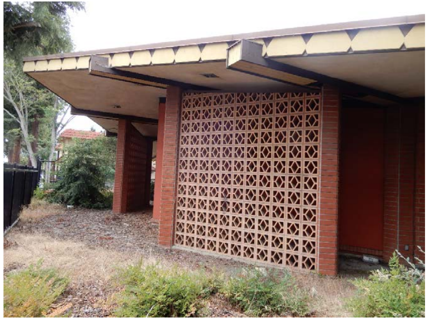
Figure 5. East façade, north portion, view southwest (ARG, July 2021)

The east façade faces onto landscaping and has a convex angled profile. Brick bays at far north and south flank four glazed bays at center (see Figure 1). Bays are articulated by engaged brick columns with a diamond-shaped footprint. Extended eaves include box purlins that are finished in painted wood and supported by brick columns with a diamond-shaped footprint (Figure 5). Areas between brick columns are infilled at the east and west with concrete breeze blocks. The eaves terminate with the typical fascia configuration.