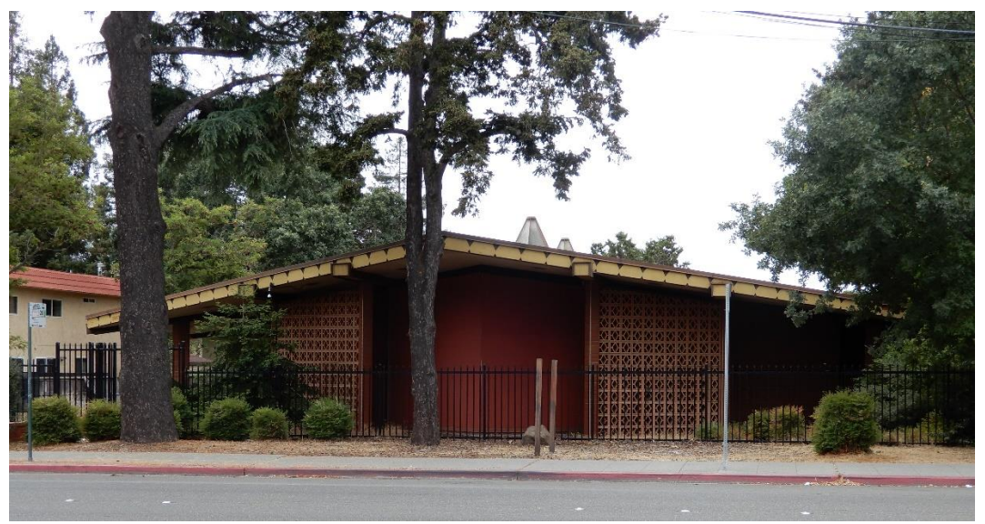
20055 Redwood Road, Castro Valley, east façade, view west (ARG, July 2021)