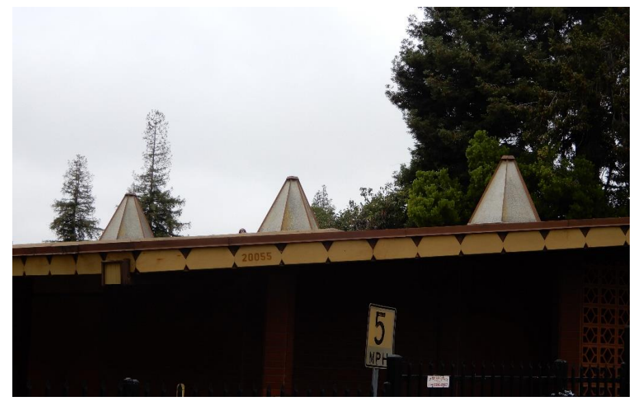
Roofline showing skylights, view northwest (ARG, July 2021)