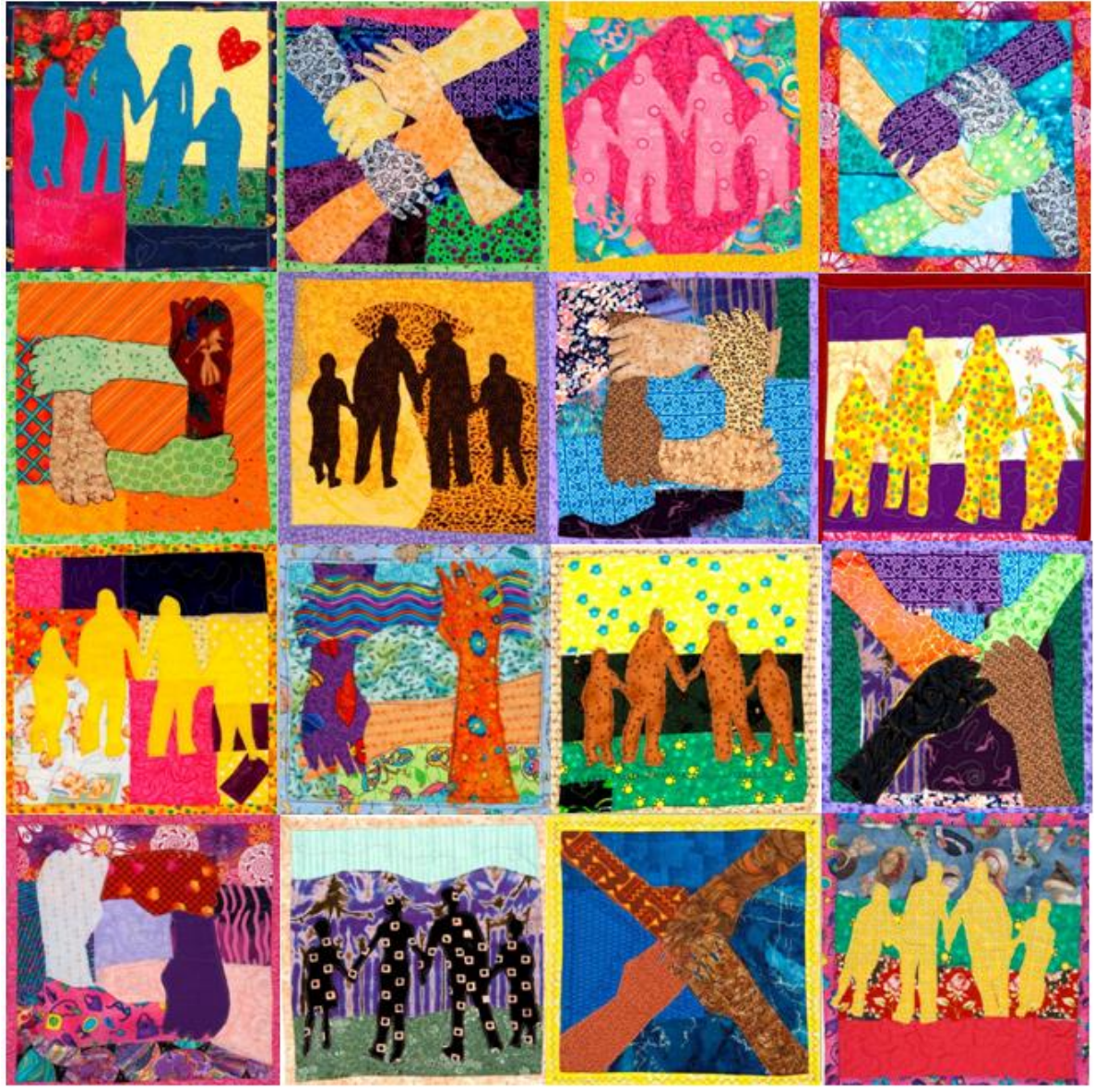
We Are Many, We Are One project features fabric quilts created by families in the Ashland community. This 100 Families Alameda County project included over 40 participants, ages 2 to 65, who created fabric quilts with images of the family unit and interlocking hands representing support, compassion and unity.